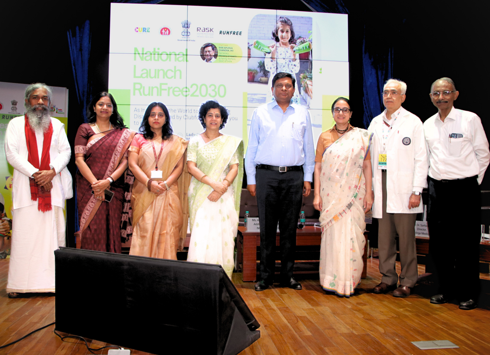
Inauguration of RunFree2030 by Shri Apurva Chandra, Secretary, MoHFW, Govt. of India on 12th June 2024